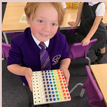
What a talented bunch they are!