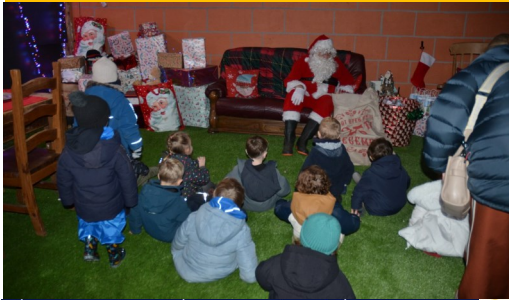
What a great day out!

Packing the perfect portion can be tough, so it's important to have a conversation with your child about how much and what kinds of foods they like to eat- you want to make sure that food is going to get eaten and not thrown away at school! Once you have the proper portions and favourite lunch foods planned out you can make your shopping list according to the meal plan and avoid throwing away anything that doesn't get used. Meal prepping lunches is something that can be done at the beginning of the week to make packing easier and to avoid anything getting wasted.