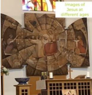
Images of Jesus at different ages